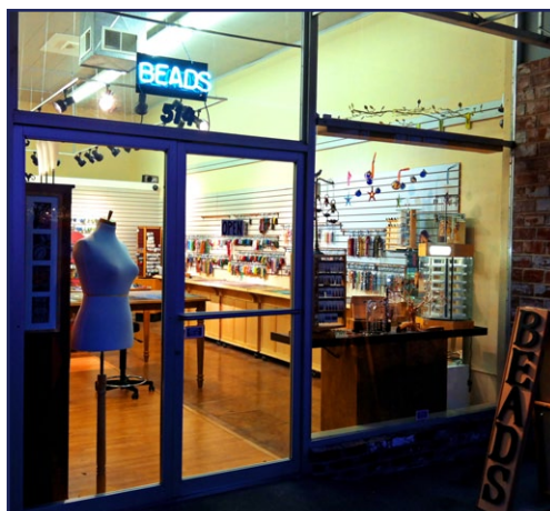
Bead Mecca - 514 SE Jackson St.